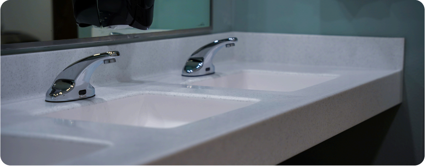
Available in Single and Double Bowl Designs

Simply stated, this Self-Draining Counter Top with a built-in drainage slope, one-piece coved backsplash and non-drip edge, can resolve your major maintenance and liability problems.