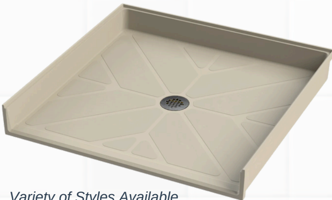
Variety of Styles Available