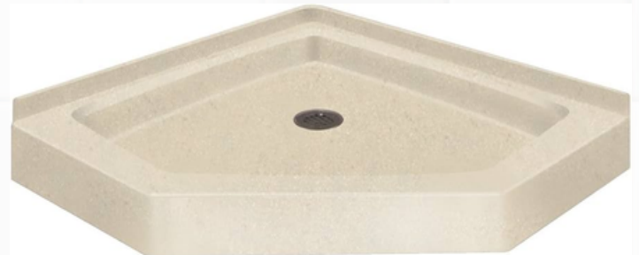
Neo-Angle Shower Pan